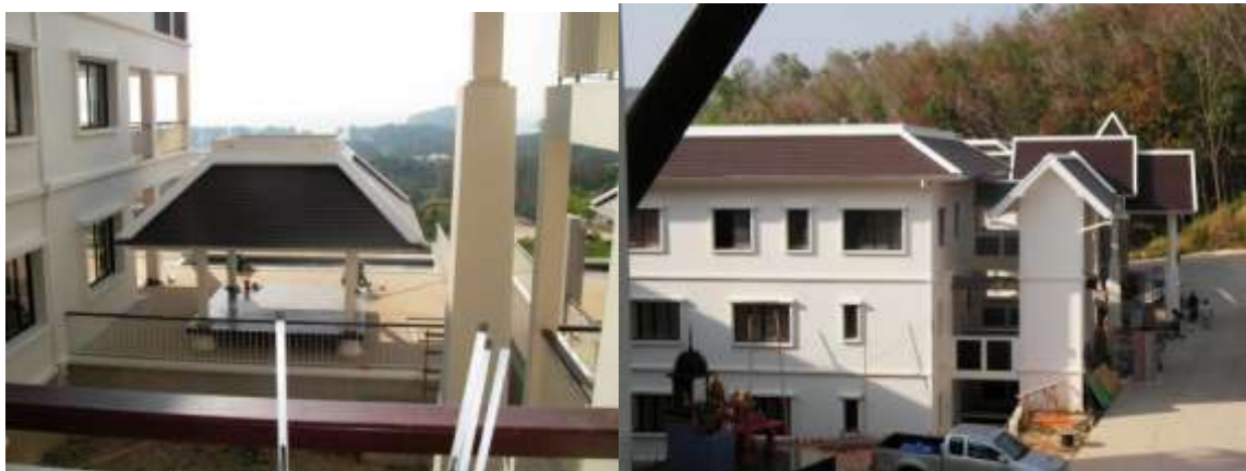
Cleaning the pool tiles/sandstone/view of the side of Lemongrass 1 looking back from LG2