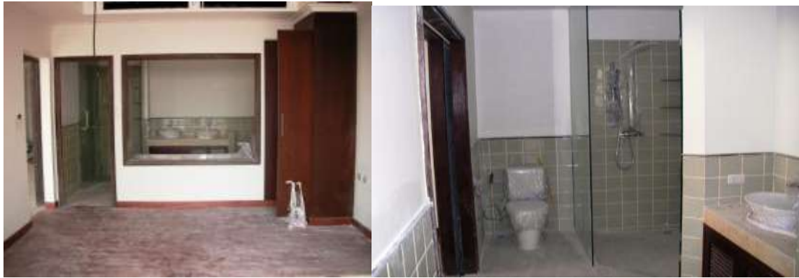
Interior of Lg2 13 &14A