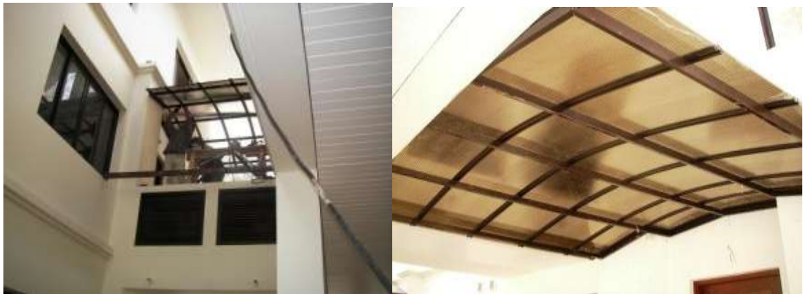
Installing the Covers to the Standard units Lemongrass 1

Redecoration of wood floors where required has commenced