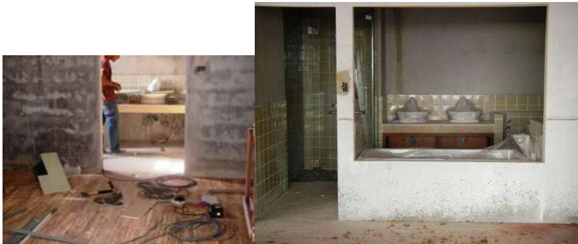
3 rd bedroom of Lg2 6B and sanitary ware in lg 2 8A