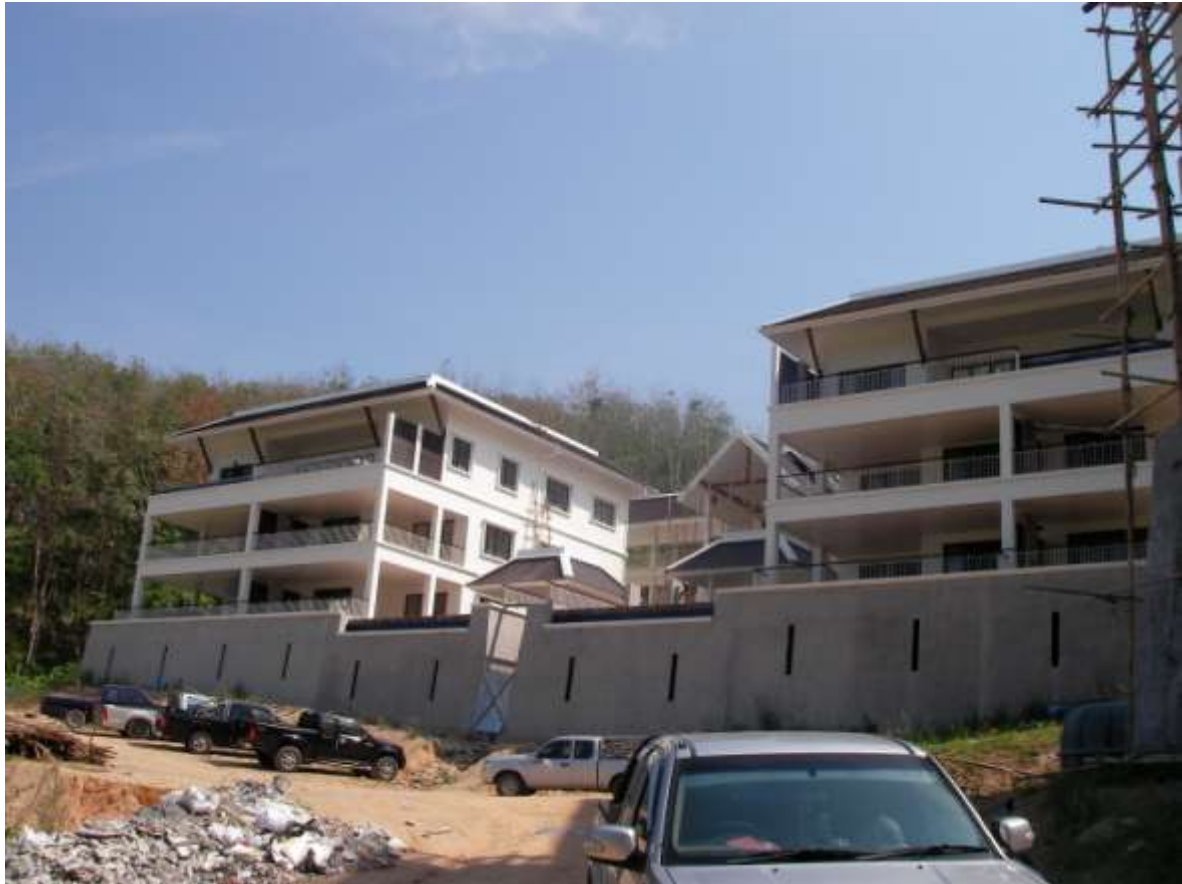
View from lemongrass 2 C&D looking back at Lemongrass 1 Lemongrass 2 (Blocks A&B)

Work on Bathroom tiling(walls) is Completed