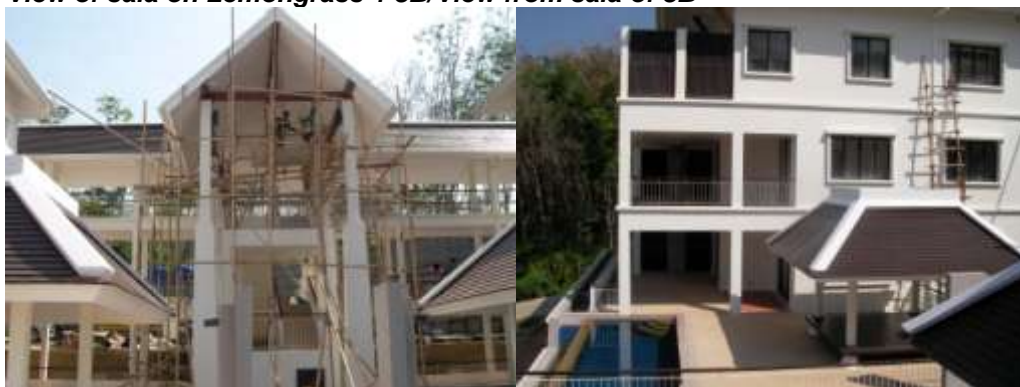
View from B units looking back at walkway/view from Lemongrass 1 5A looking across Lemongrass 1 block containing units 8B/4A and 1 P