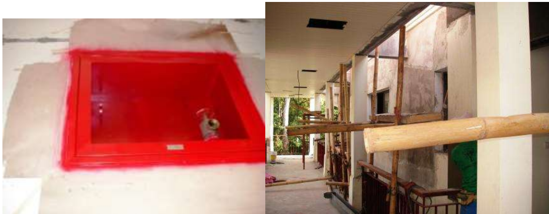
Repainted fire hose holder/Rendering rework on exterior of building