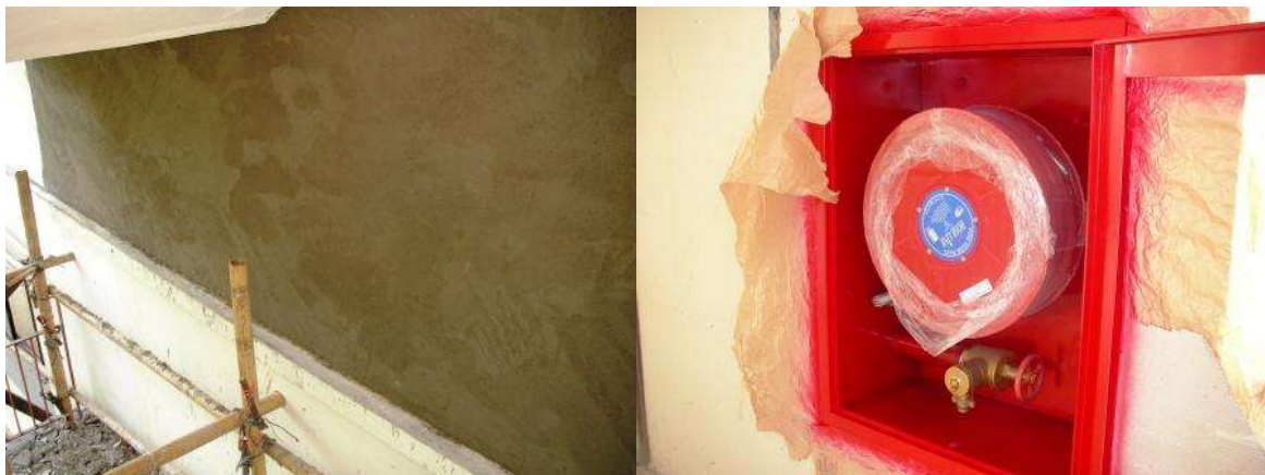
Rendering rework on building exterior/fire hose repaint.

141, Layan Soi 1, Moo6, Cherngtalay, Thalang. Phuket. 83110 Thailand