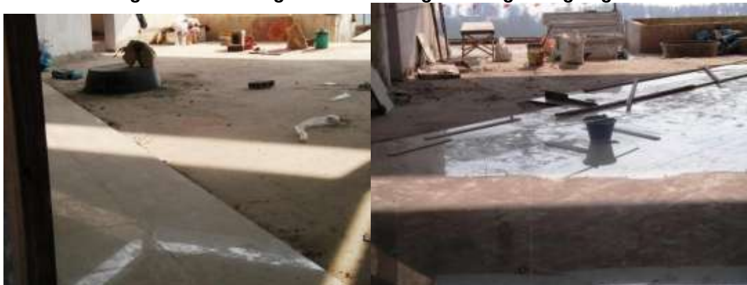
Installing penthouse 2p and 1P floor tile in living area