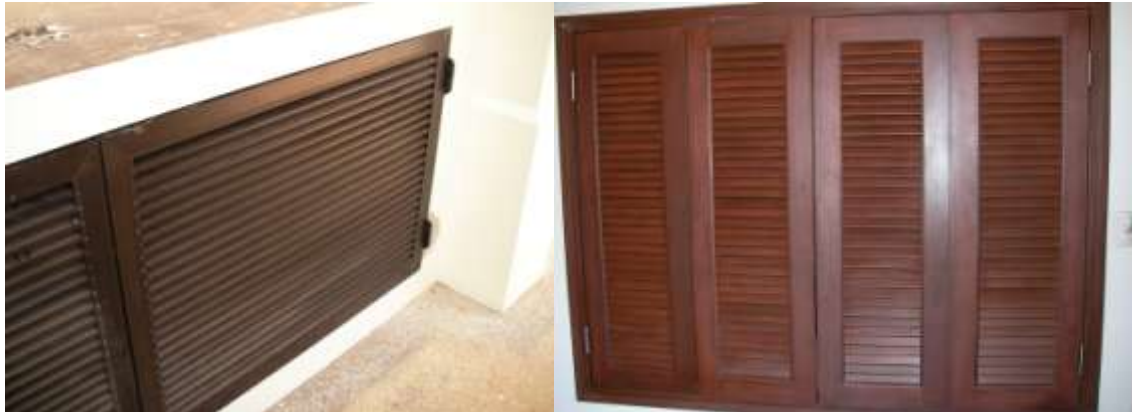
Air con compressor vent covers/shutter dividing master bath/master bedroom