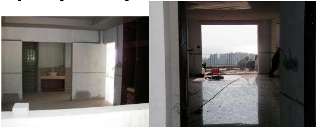
Installed ceiling 2 nd Bedroom Lg 2 204A/ Working on fixing railings Lg2 203A