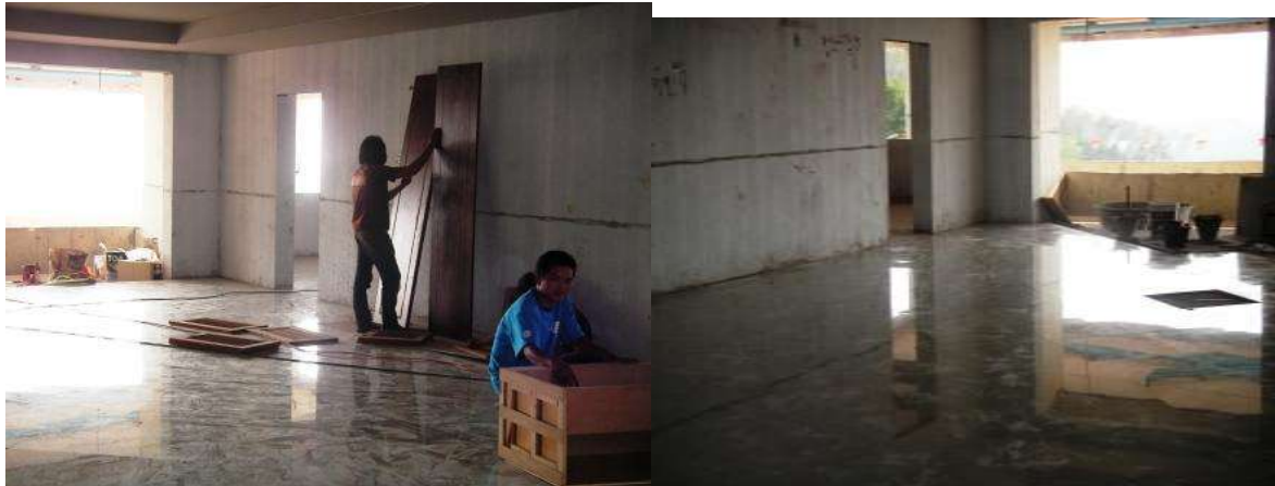
Work on the wardrobe door finishing lg2 201P/Floor tile in Lg 2 202P