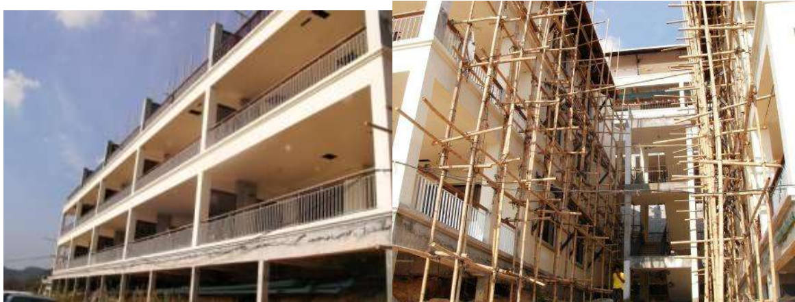
Railings painted 1 st coat in finishing colour/Scaffold erected between the buildings

Repair work on some damaged facia/rendered areas is ongoing