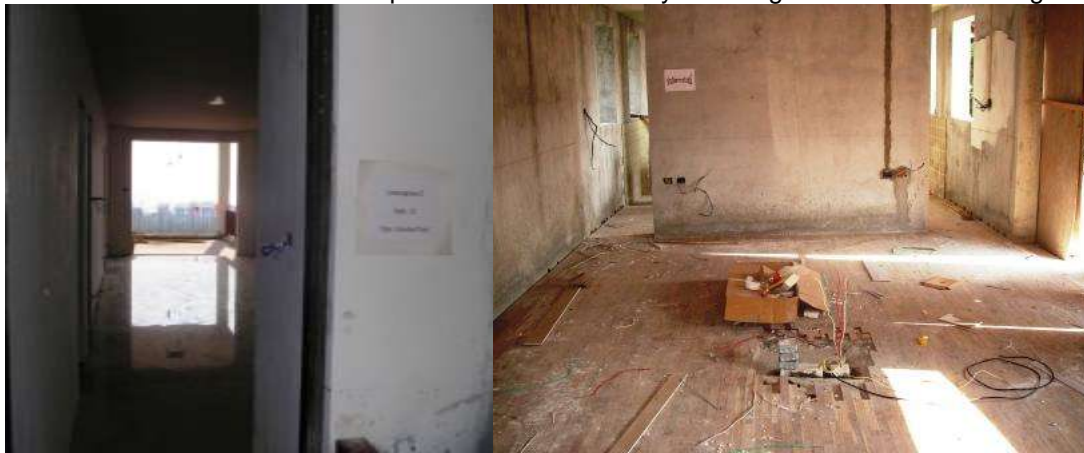
Tiling and ceiling work installed Lg 2 11A/Floor work in Master 12C

Wardrobe carcasses have been placed into rooms ready for fitting of doors and finishing.