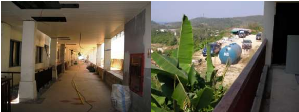
Cabling in common area walkway/view from lg2 42A of new water tank delivery

Electrical system cabling has commenced for Common area walkways etc