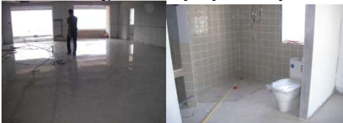
Lg2 201P Floor tile installed/commence fitting sanitary ware