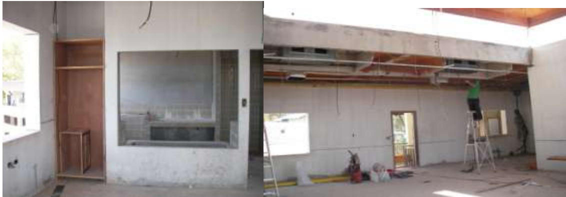
Wardrobe carcasses being positioned/Installing ceiling frame both in Lg2 1P