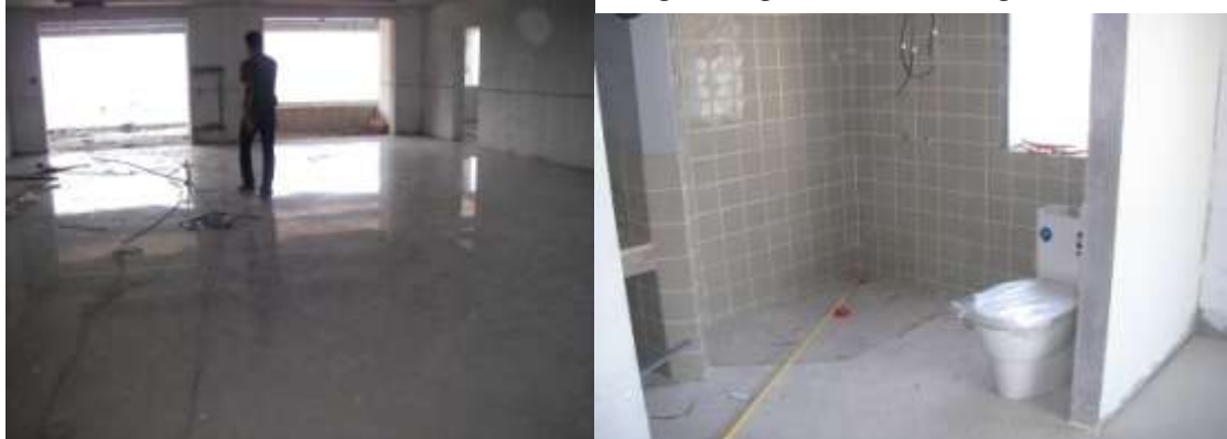
Lg2 201P Floor tile installed/commence fitting sanitary ware