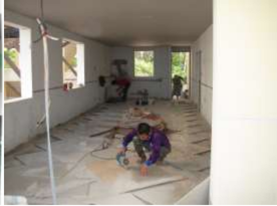
Installing ceiling Lg 2 203A/ Floor tiling Lg 204A