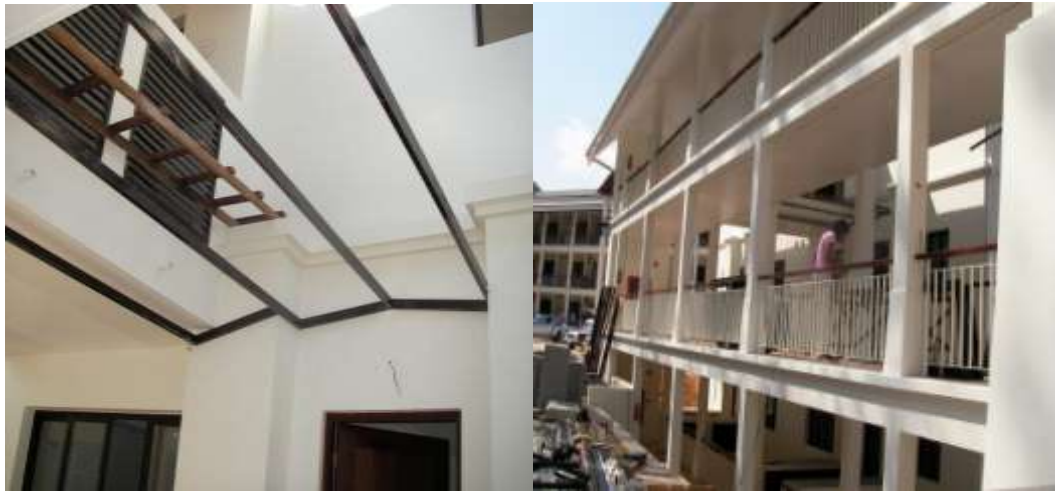
Installation of covers over standard unit entrance/Working on making the frames for the Air con vent covers