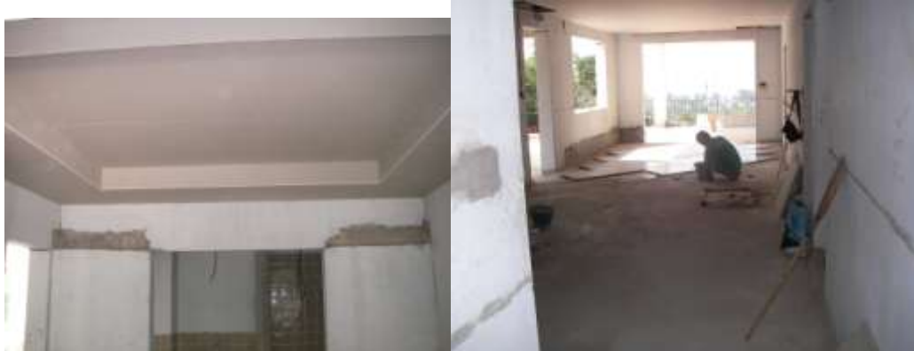
Ceiling being installed Lg2 12c/Tiling floor Lg2 12C

141, Layan Soi 1, Moo6, Cherngtalay, Thalang. Phuket. 83110 Thailand