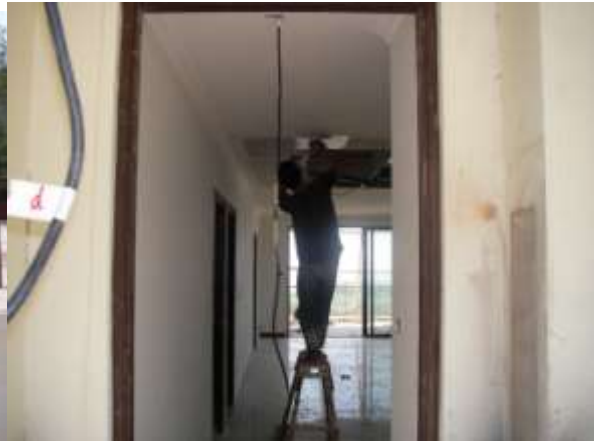
Railings on roof terrace completed awaiting hand rail installation/ ongoing interior decoration