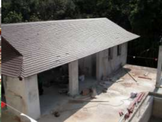
Installing framework for ceiling 12C and the roof tile colour change master bedroom 12C