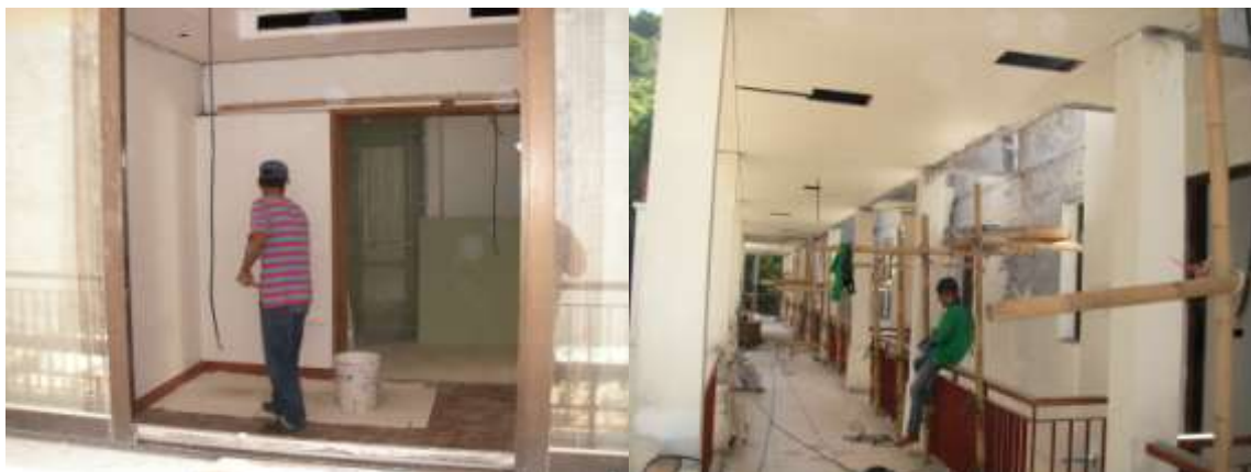
Interior decoration/repairing damaged rendering top floor Lg2 C&D

141, Layan Soi 1, Moo6, Cherngtalay, Thalang. Phuket. 83110 Thailand