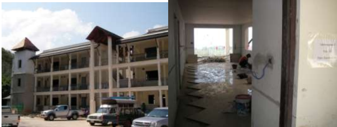
View of rear of Lemongrass 2 A&B Note roof being coloured/tiling of floor in Lg2 11A

Wardrobe carcasses have been placed into rooms ready for fitting of doors and finishing.