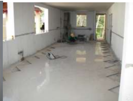
Ceiling works and floor tile works Lg2 4A & 5A