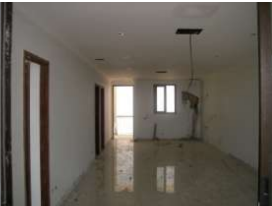
Lighting fittings installed to ceilings/view of interior Lg2 25A