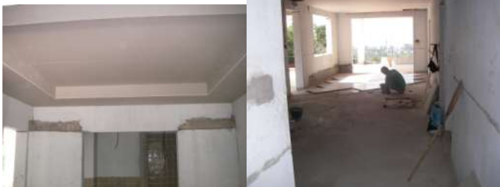
Ceiling being installed Lg2 12c/Tiling floor Lg2 12C