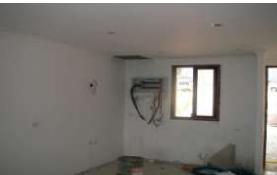
Inspection hatch in bathroom/circuit boards bein installed