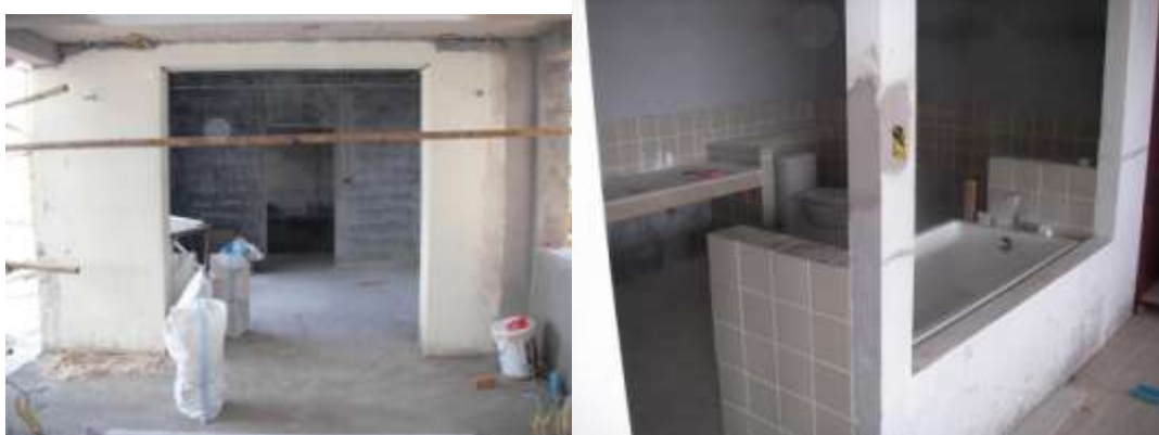
Lg2 6B Master bedroom entrance(modified)/6b bath installed in 2 nd Bedroom

141, Layan Soi 1, Moo6, Cherngtalay, Thalang. Phuket. 83110 Thailand