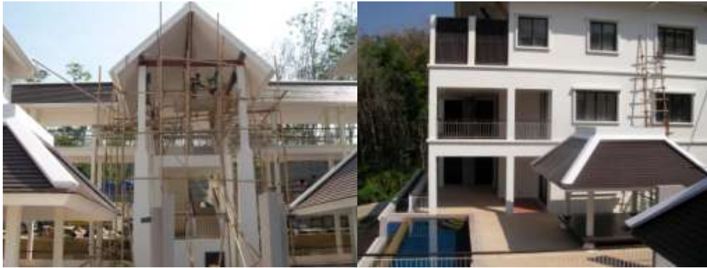
View from B units looking back at walkway/view from Lemongrass 1 5A looking across Lemongrass 1 block containing units 8B/4A and 1 P